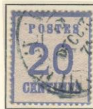
Muhsen im Elsass