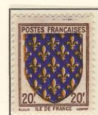
Île de France