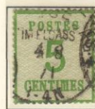
Im Elsass 4.8.71