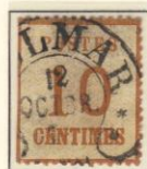
Colmar 12 Octbr