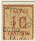
Colmar 30 Oct.